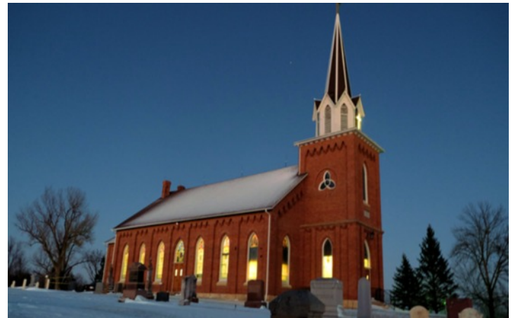
The good news of the birth of Jesus was read in the church sanctuary on Christmas eve just after sundown.